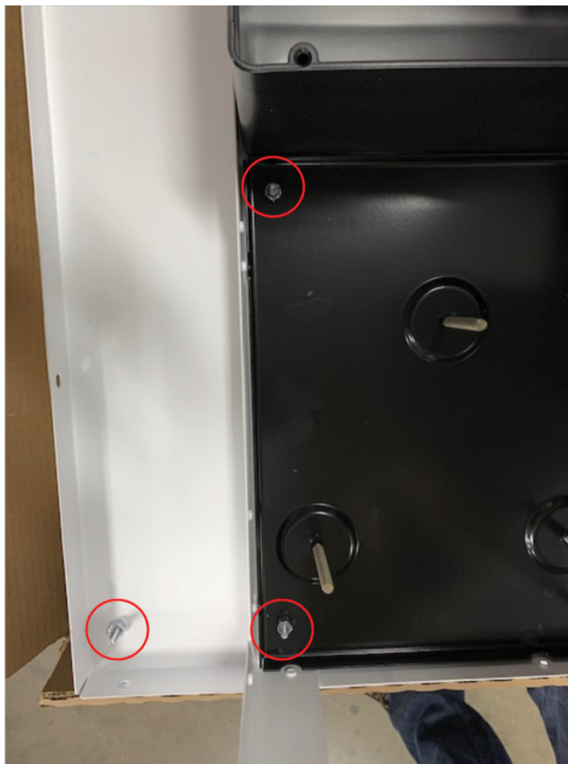
Locations 9, 10, 11

Have Questions? Contact the Quest service department at 877-420-1330 or service@questclimate.com